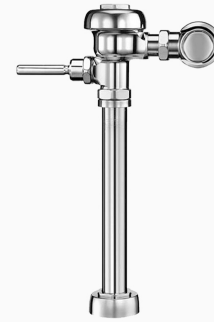
Variation Not Shown: 1" Offset